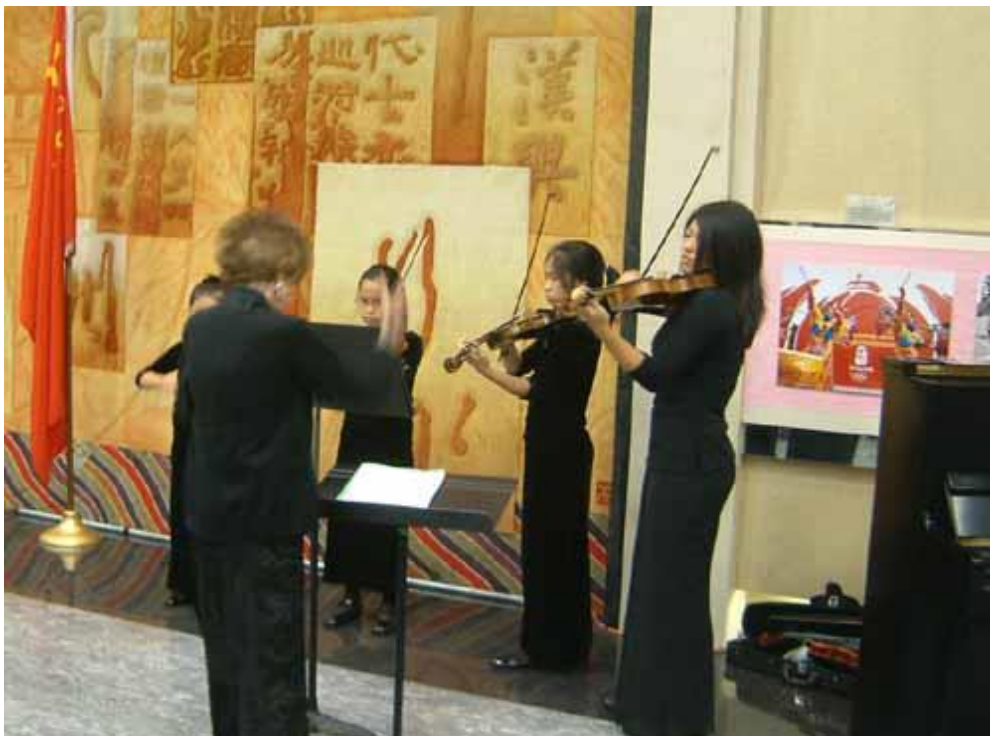
Figure 1: Musical college violin playing teaching